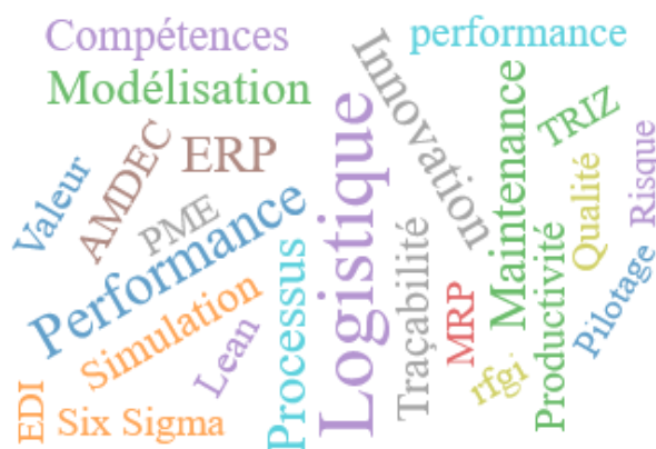
Figure 1: Word cloud

Urban Logistics, Reverse Logistics, Sustainable Supply Chain, among others.